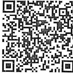
QR for participation confirmation